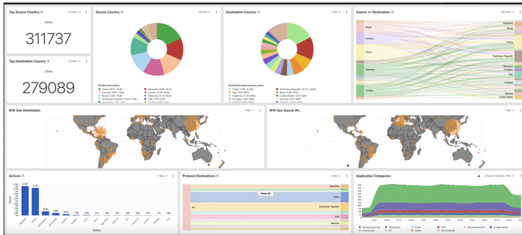
Figure 2: Falcon dashboard with analysis of FortiGate logs

The FortiGate data connector sends firewall logs to the CrowdStrike Falcon platform, where the data is correlated and enriched with high-fidelity security data and threat intelligence within Falcon, unifying visibility for extended protection across networks and endpoints. The integration enables analysts to store, analyze, and visualize firewall logs alongside additional endpoint and security data in a single console, helping detect suspicious activity swiftly and enabling an effective layered security approach.