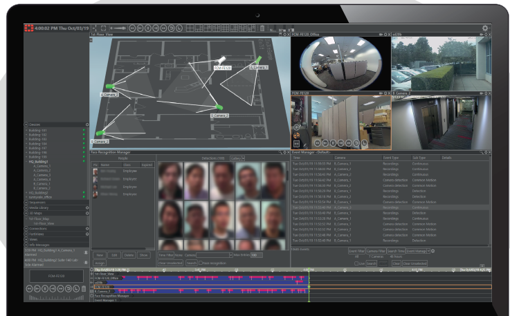
FortiRecorder Central VMS

FortiRecorder-VM is supported on VMware's vSphere Hypervisor, Microsoft Hyper-V, KVM, Citrix XenServer, and Amazon AWS (on-demand).